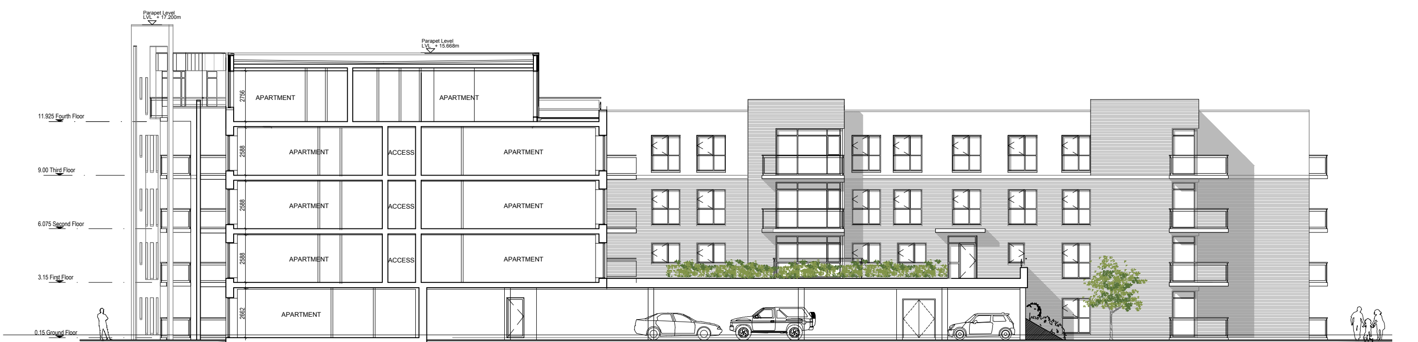
SECTION B - B