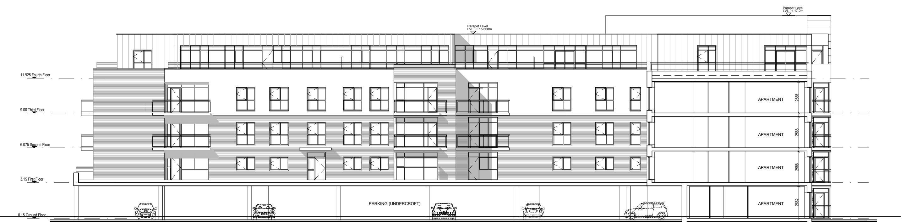
SECTION A - A